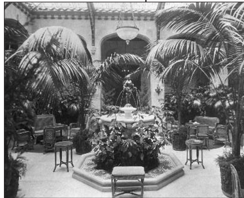
The Palm Court, inside Hempstead House, with its original decor.

Actual Journal Page Size is 8.5" x 11". This layout is reduced. The ad dimensions sizes shown are the actual sizes your ads will appear.